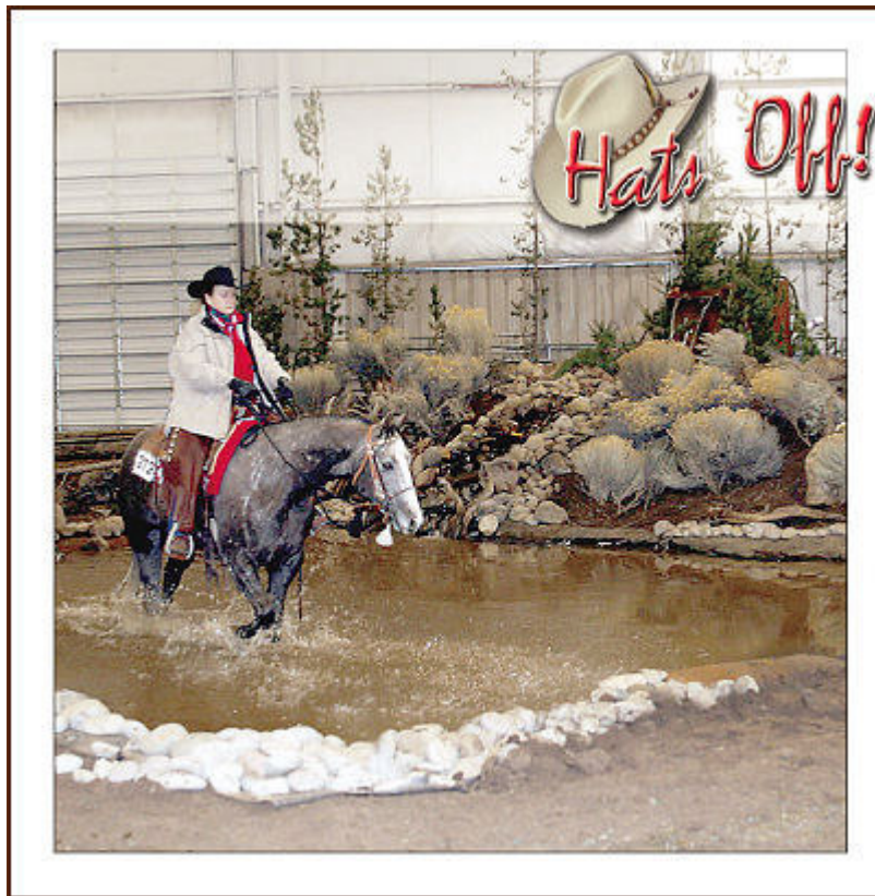
Article and photo from the Rocky Mountain Rider Magazine